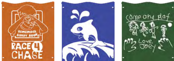
Custom panel examples

Once all designs have been collected, have students or faculty vote on their favorite design from the grade level categories (for a total of three different custom panels for your play structure).